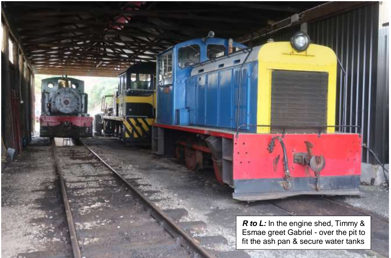
R to L: In the engine shed, Timmy & Esmæe greet Gabriel - over the pit to fit the ash pan & secure water tanks