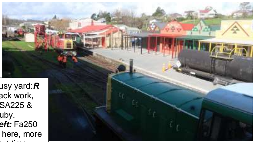
Busy yard: R track work, DSA225 & Ruby. Left: Fa250 is here, more next time