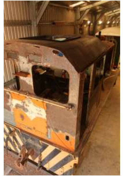
Above: Projects awaiting: carriage Bittern to refurbish & engine Lennie to complete. Can you help as a volunteer for such projects, & being a diesel engine mechanic? Ring 021-171-2697