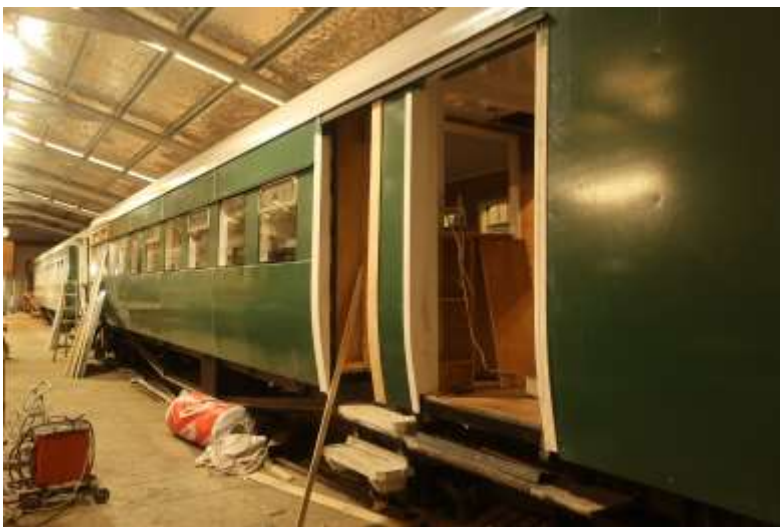
Progress on the carriage, Fantail. Above: two similar views a year apart. Left: cladding almost complete. Below: 18 months ago, start of rebuild