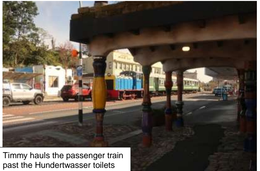
Timmy hauls the passenger train past the Hundertwasser toilets