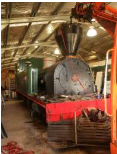
Below: Side tanks & funnel on prior to insulation & David & Mike puzzle out "fittings".