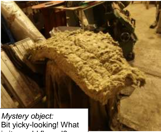
Mystery object: Bit yicky-looking! What is it, an old flannel?