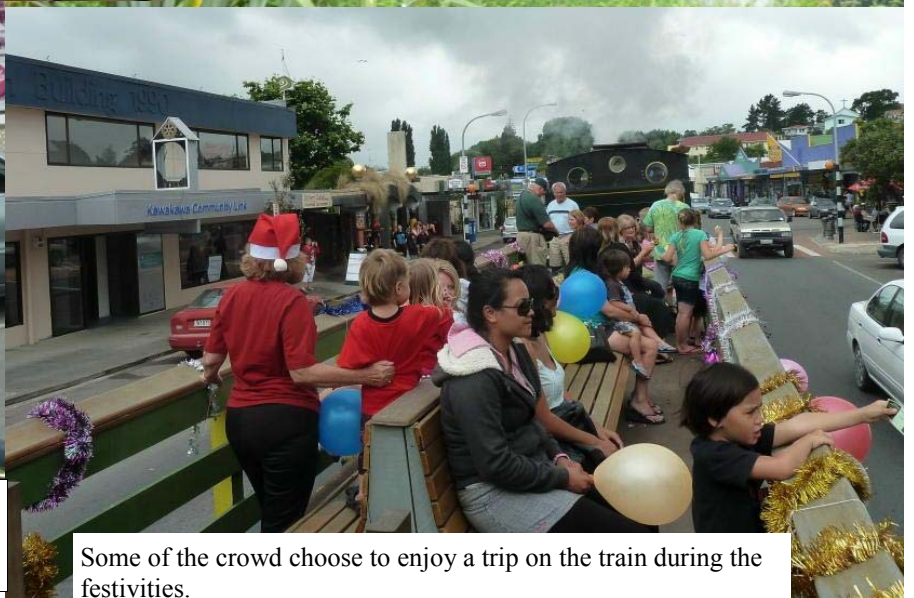
Some of the crowd choose to enjoy a trip on the train during the festivities.