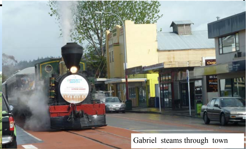
Gabriel steams through town