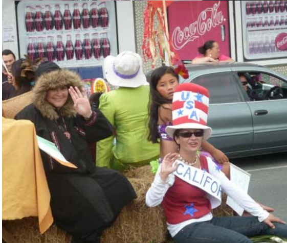
Did President Obama really send out his Ambassador to share the festive seasons goodwill with the good people of Kawakawa and the Bay of Islands ?