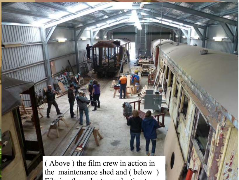
( Above ) the film crew in action in the maintenance shed and ( below ) Filming the volunteers planting trees at the BBQ stop at Longbridge.