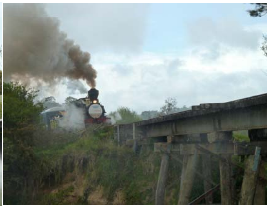
TV 6 day and Gabriel steams over bridge 5