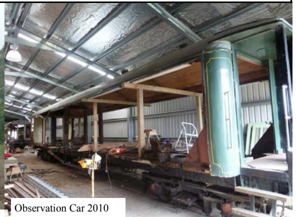
Observation Car 2010