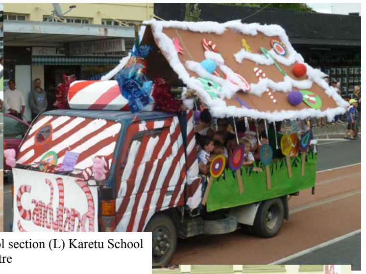
Equal runners up in the School section (L) Karetu School and ( R) Kawakawa Play Centre