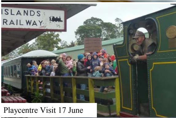
Playcentre Visit 17 June

Kia Kaha Christchurch ; Kawakawa sends their best wishes to all the Cantabs following the devastating earthquakes,