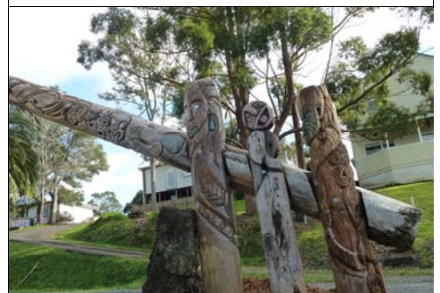
What has this got to do with the Railway??